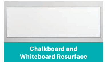
Chalkboard and Whiteboard Resurface

For installation service requests, call 1-800-328-3908 or visit 3m.com/3M/en_US/graphics-signage-us/resources/find-an-installer