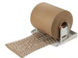
Length of Roll

Not expanded: 1000 sq. ft. Expanded: 1300 sq. ft.